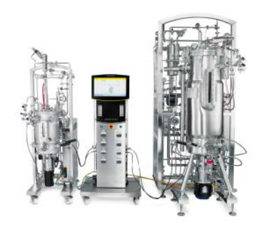
Biostat® D-DCU 10 - 200 L

Also scalable to multi-use technologies -