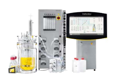
Biostat® B-DCU with Univessel® Glass 1 - 10 L