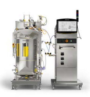
Ambr<sup>®</sup> 250 High Throughput Perfusion