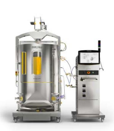
Biostat STR® 1000