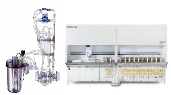
Ambr<sup>®</sup> 250 High Throughput Perfusion