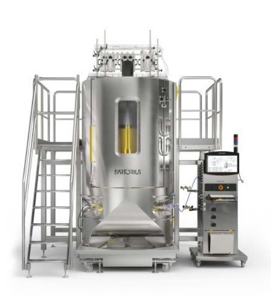
Biostat STR® 2000