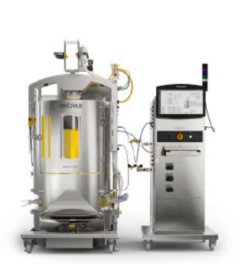
Biostat STR® 500

Also scalable to multi-use technologies -